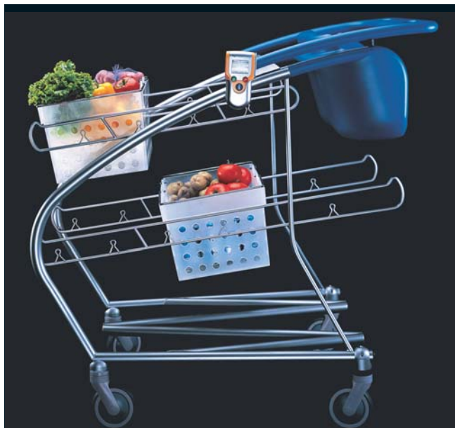
IDEO REDESIGNED the mundane shopping cart for ABC-TV's Nightline in just five days

IDEO's strategic relationship with P&G runs deep. In weekly workshops and monthly stays in Palo Alto, P&G managers