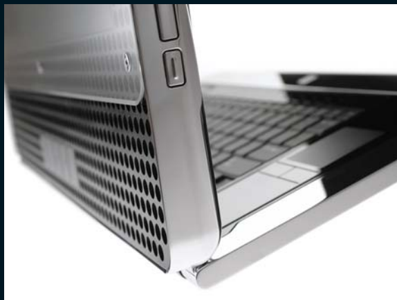
IDEO CREATED a concept computer, the Florence, to showcase Intel's 2005 mobile-chip capabilities